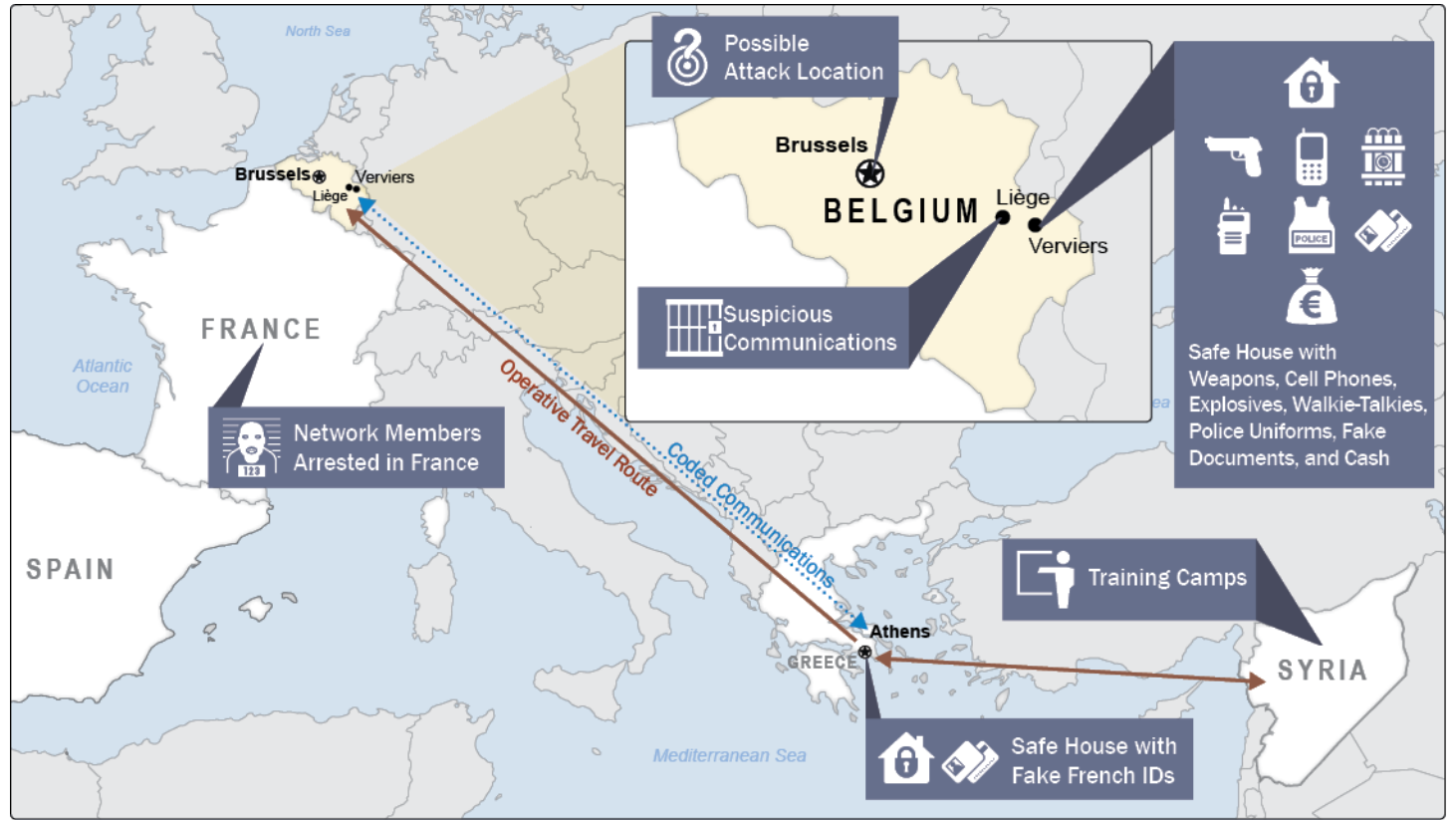
(U) Figure I. Map of Group Activities