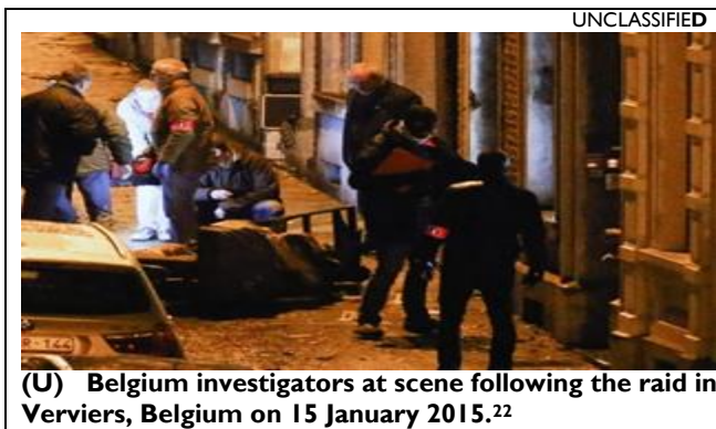
(U) Belgium investigators at scene following the raid in Verviers, Belgium on 15 January 2015. 22